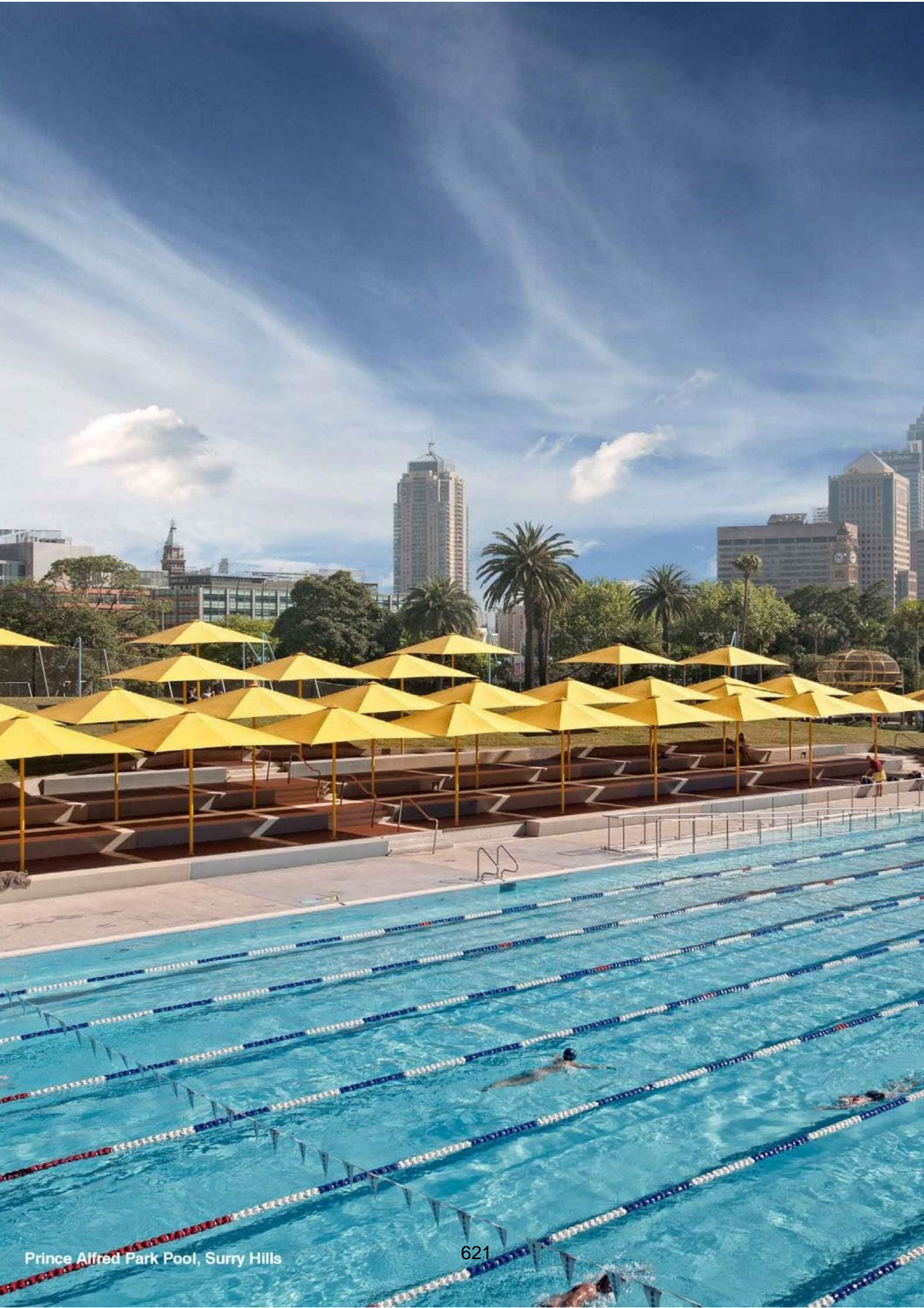
Prince Alfred Park Pool, Surry Hills