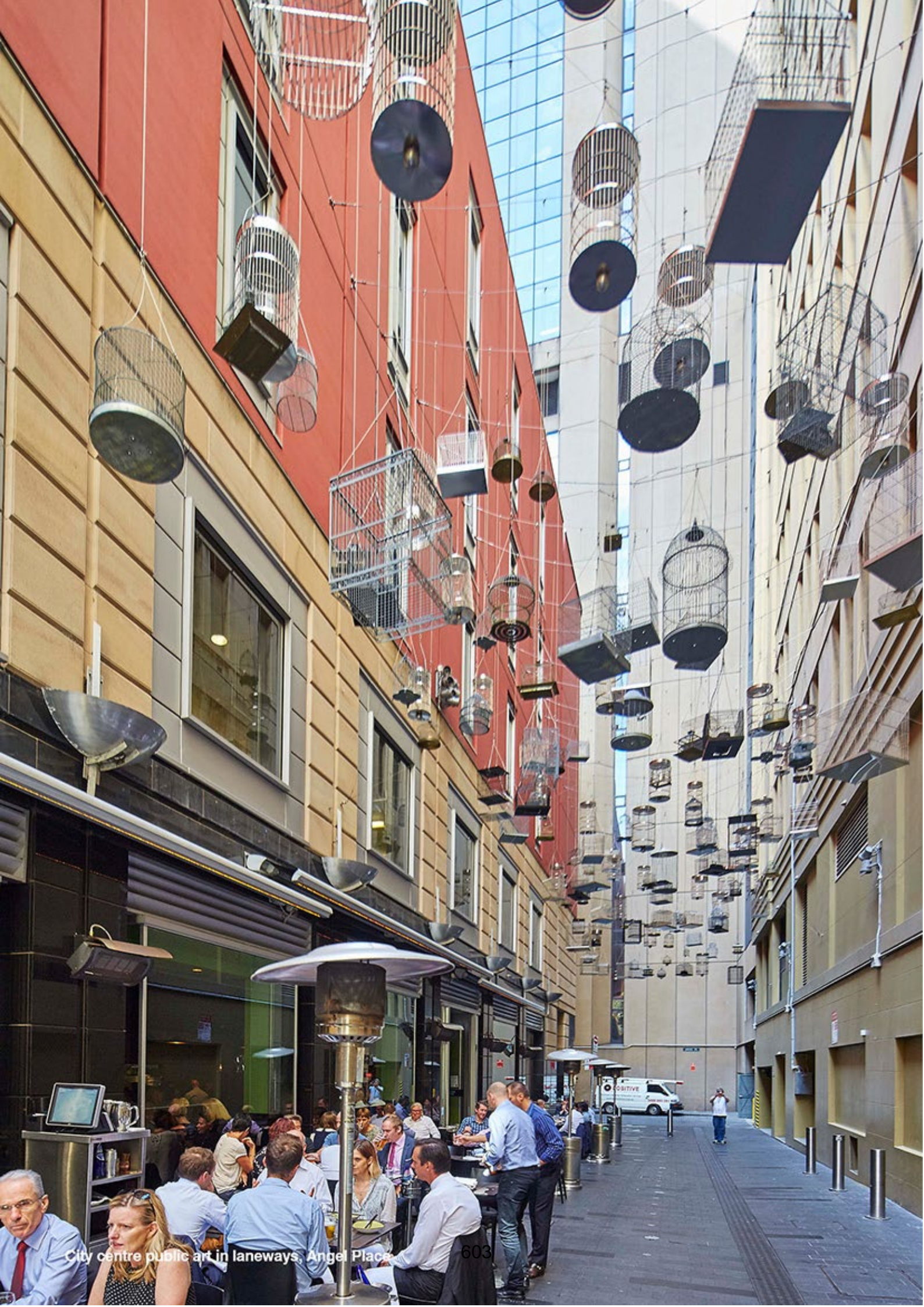
City centre public art in laneways, Angel Place