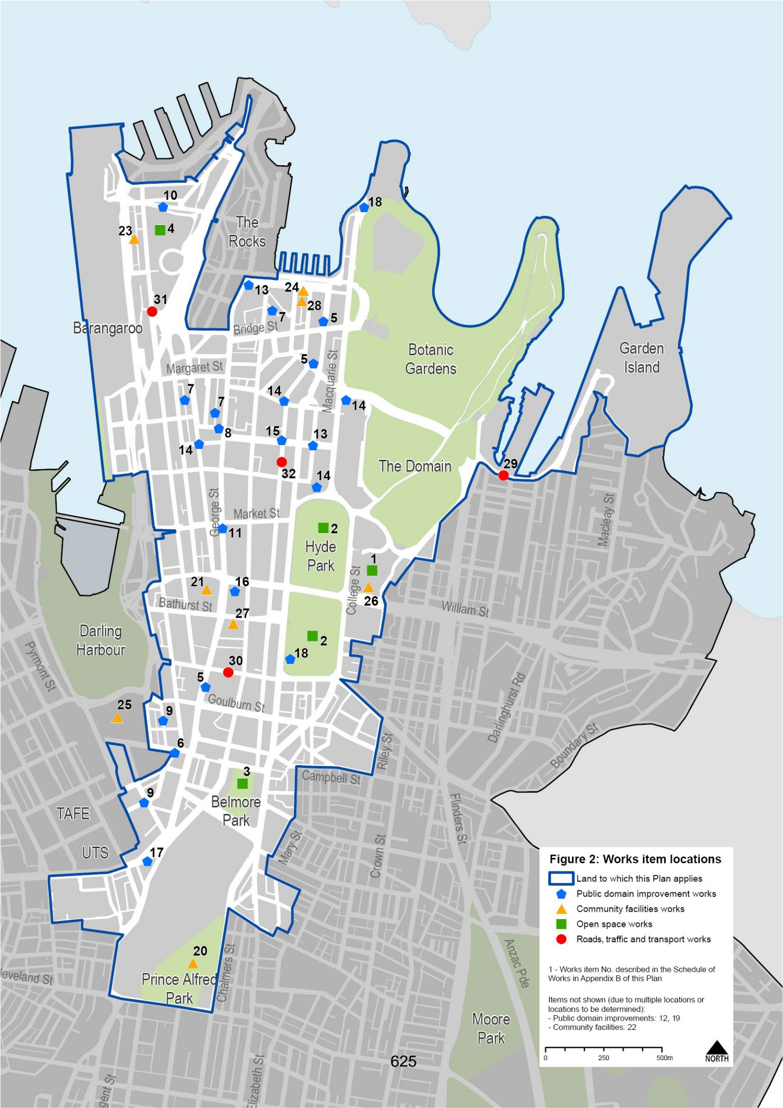
Figure 2: Works item locations